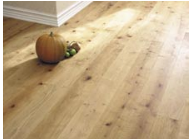
Osterbymo Solid Wooden floor, Alder.